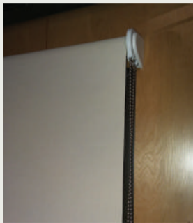
Reverse Roll (Waterfall)