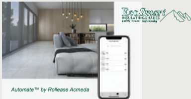
Automate™ by Rollease Acmeda

Gordon's Window Decor is a leader in the industry for motorized shades. Motorization is great for any window - particularly windows that are hard to reach, banks of windows, or particularly large windows.